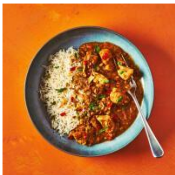
South Indian-Style Chicken Cashew Curry (30 mins)

You can see Gousto's menu on their website here . Below are examples of meals you will find on their website. Over the first 6 weeks, on average these would each cost £1.79 per portion including delivery if you ordered 4 recipes with 4 portions.