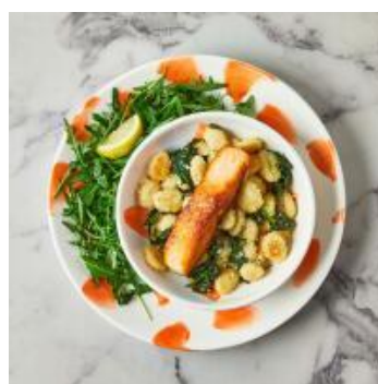
Salmon With Spinach & Lemon Gnocchi (10 mins)

To give you an idea what you will save per week, the average discount over the 6 weeks will mean that, including the delivery fee: