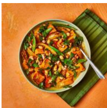
Nutty Sweet Potato & Sugar Snap Curry (30 mins)