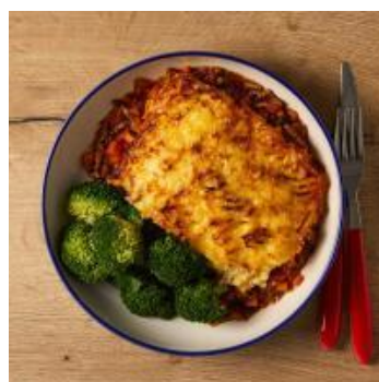
Comforting Cottage Pie (40 mins)