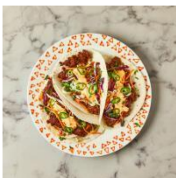
Fiery Chipotle Meat-Free Tacos with Coriander Slaw (10 mins)