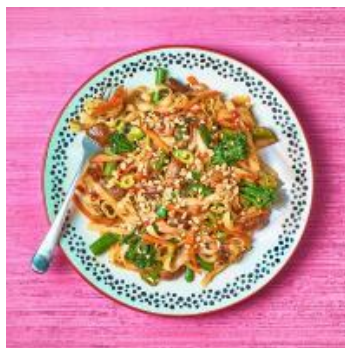
Plant-Based Mushroom Pad See Ew-Style Noodles Curry (25 mins)